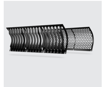
Screen Basket System